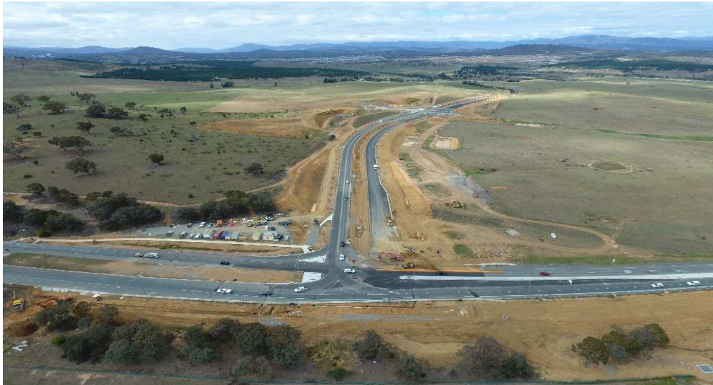
John Gordon Drive Stage 3A