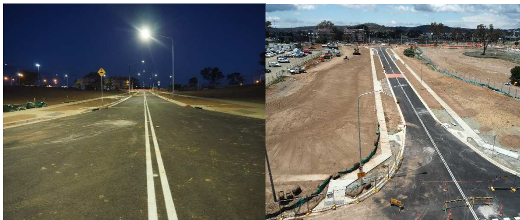
Ernest Cavanagh Street extension