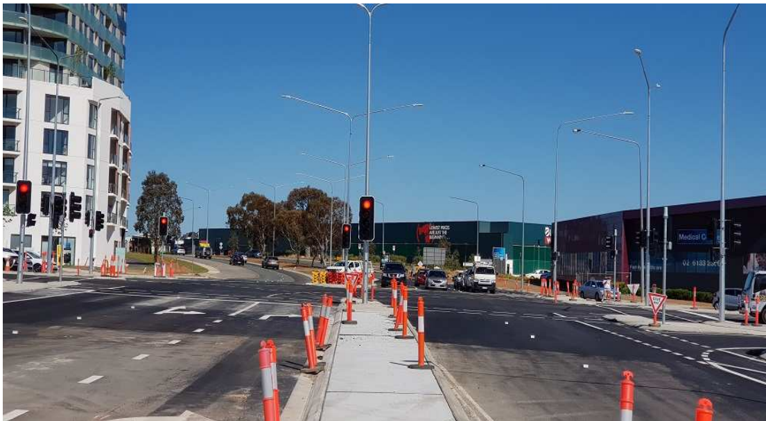
Gundaroo Drive Stage 1